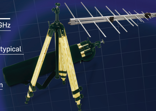
LP-04 and tripod