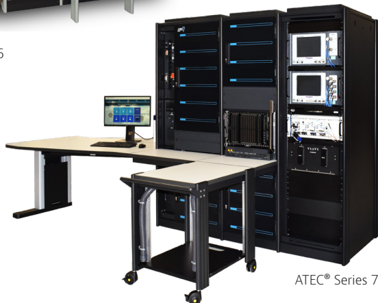
ATEC® Series 7