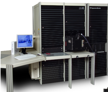
ATEC® Series 6

The RF instrumentation package includes PXI format synthetic instrument modules and the VIAVI NextGen bench test equipment.