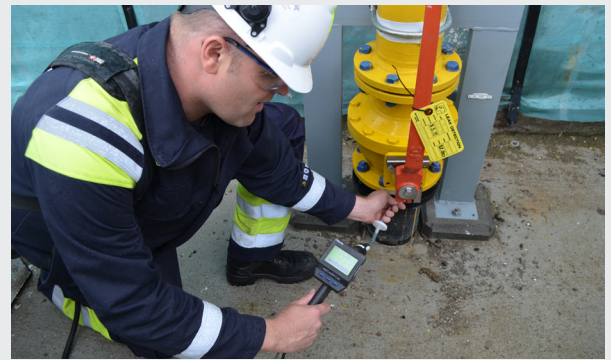
Close, contact-based inspections, like those performed with an FID, can be time-intensive and can create safety hazards as the operator is often in the gas leak when locating the faulty component.

"All in all, the FLIR GF77 is a reliable and highly ergonomic camera for leak detection jobs," said Schraeyen. "And it's an ideal camera for inspections at industrial companies like Tessenderlo Kerley that want to reduce safety risk or prevent product loss."