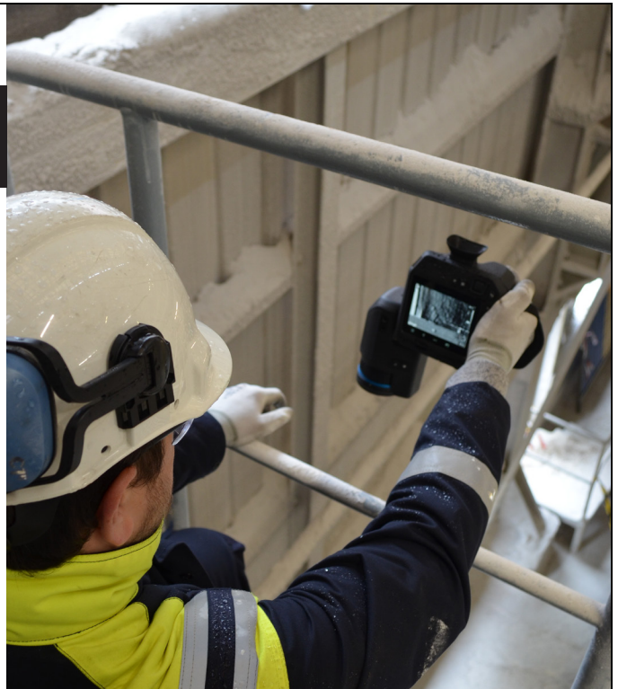
"The GF77 rotating optical block makes it easier to inspect areas that are high up or difficult to reach," said Jan Van Hout with The Sniffers

"One of the biggest differences between using optical gas imaging cameras versus other devices is speed," said Schraeyen. "With a Flame Ionization Detector or FID for example, this inspection job would take longer. With a FLIR camera, like the GF77, we can inspect the entire station in two minutes."