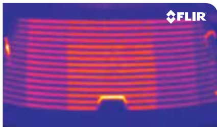
Inspection of a windshield defroster for damaged electrical elements.

The FLIR A315 can be ordered with an environmental housing. The housing increases the environmental specifications of the FLIR A315 to IP66, protecting the camera's from dust and water without affecting any of the camera features. The housing is available for cameras that are equipped with a 25°, 45° or 90° lens, and can be ordered separately as an accessory.