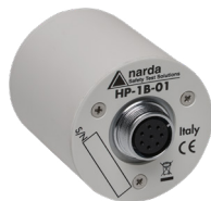
Magnetic field probe

This means that emissions from high-voltage cables and transformer stations can be recorded. Further, it is possible to combine up to two probes, e.g. an electric and a magnetic field probe in the so-called “dual probe configuration”.