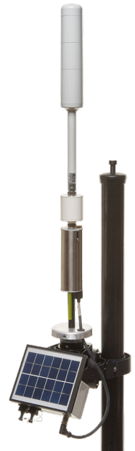
Dual probe configuration (without radome)