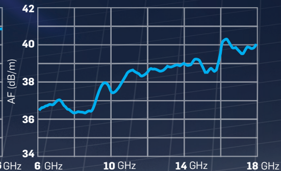
DR-01 - Antenna Factor