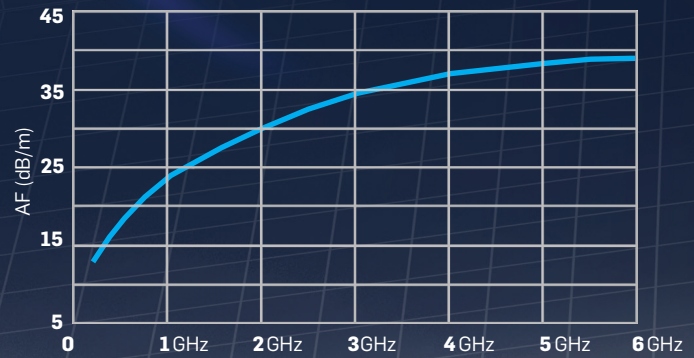
LP-04 - Antenna Factor