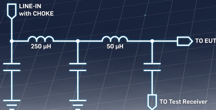
L2-16B equivalent circuit