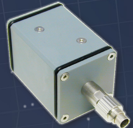
6630FOA Fiber Optic Adapter