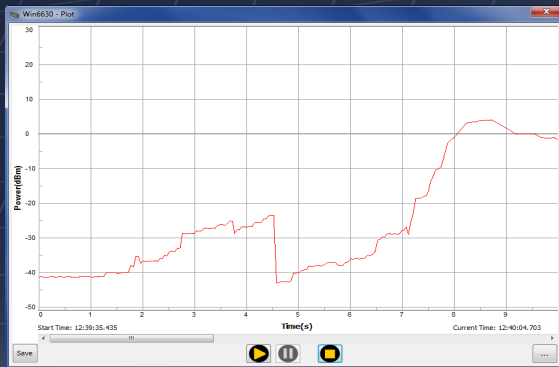
Power vs Time plot

6630FOA Fiber Optic Adapter. Converts the USB of the 6630 into a fiber optic compatible signal, for optimal noise immunity or simply to extend the link up to 80 m Includes: 10 m fiber optic cable, USB-OC Optical Converter, battery charger, UK and USA plug adapter, user's manual FO-6630/10 Fiber optic cable (10 m) FO-6630/20 Fiber optic cable (20 m) FO-6630/40 Fiber optic cable (40 m) FO-6630/80 Fiber optic cable (80 m)