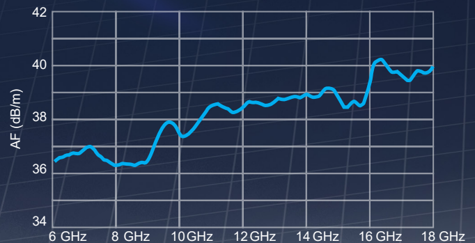
DR-01 - Antenna Factor