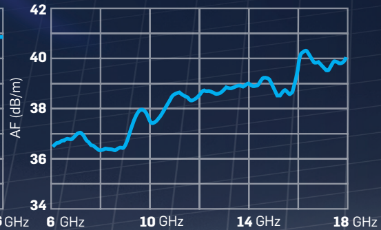
DR-01 - Antenna Factor