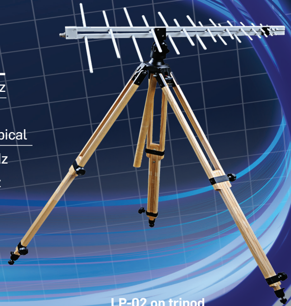
LP-02 on tripod