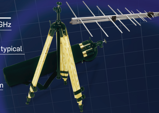
LP-04 and tripod